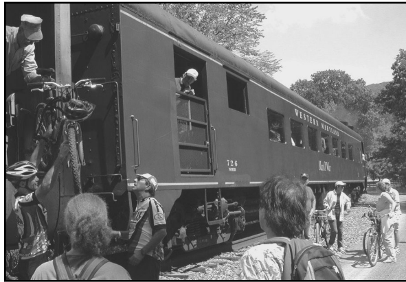
Train riders becoming trail riders at Woodcock Hollow.

That was the scene on August 24th when the newest segment of the Great Allegheny Passage was dedicated. A crowd of several hundred gathered at the trail access in Frostburg, MD to celebrate and ride on the new six-mile section from there to Woodcock Hollow.