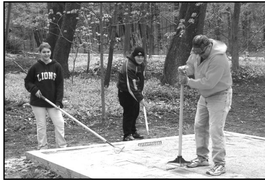
Students help build tent pads at Cedar Creek Park.

Last year Belle Vernon students built the picnic tables with shingled roofs. This year Yough students continued at the site, building fire rings, tent pads, restroom, and are currently working on the shelter. Thanks to the