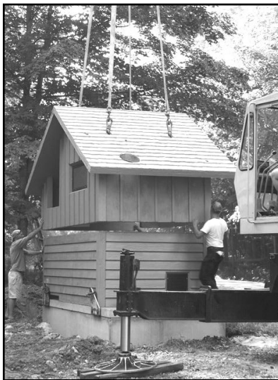
SST placed by crane in Cedar Creek Park.

The Regional Trail Corporation recently added a water pump to the Roundbottom primitive campground near Layton (Milepost 102). Roundbottom is adjacent to the trail and fronts the Youghiogheny River, making this location accessible for both trail and river users. A Sweet Smelling Toilet is slated for installation there in the spring. No fee, but groups of 10 or more must make reservations. Contact: Regional Trail Corporation, P.O. Box 95, West Newton, PA 15089 Phone (724) 872-5586. ■