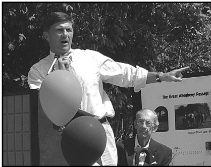
Governor Robert L. Ehrlich, Jr.

A gaggle of bikers from Maryland, Pennsylvania, and West Virginia were on hand to listen intently to the comments of local, regional, and state dignitaries. The crowd was most attentive to Maryland Governor Robert L. Ehrlich, Jr., who pleased trail supporters with a pledge of continued financial support for trails in western Maryland, including the promise to fund the last link of the Great Allegheny Passage from Woodcock Hollow into Cumberland, MD and the C&O Canal Trail. The response was rousing applause.